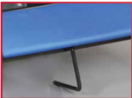
Bottom Hook Secures to Bleacher