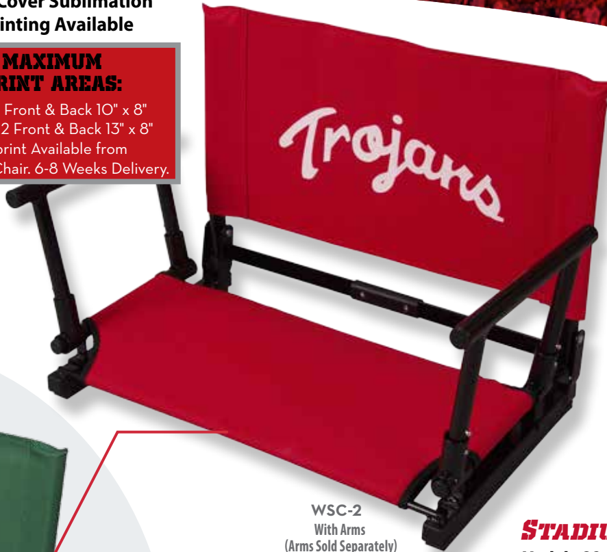
WSC-2 With Arms (Arms Sold Separately)

#SC-2 Front & Back 10" x 8" #WSC-2 Front & Back 13" x 8" Imprint Available from StadiumChair. 6-8 Weeks Delivery.