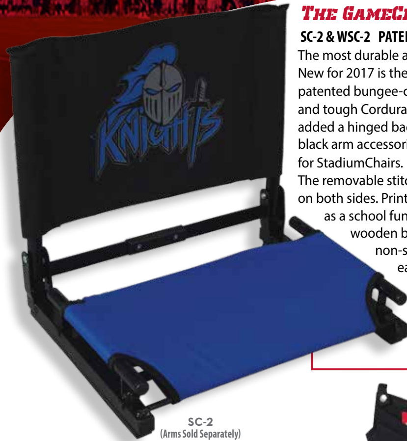
SC-2 (Arms Sold Separately)

The removable stitched back opens up for easy screening or embroidery on both sides. Print team logo on one side and sponsor logos on the back as a school fundraiser. The GameChanger™ fits virtually any metal or wooden bleacher. Bottom hook secures to bleacher; rubber non-slip skids. Folds neatly; attached tote handle for easy carry. Arms sold separately.