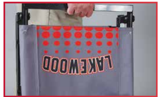
Tote Handle for Easy Carry