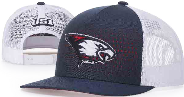
CL1 | Embroidery | < 3D >

FIT: ADJ. SNAPBACK | SHAPE: MID-PRO | FABRIC: TWILL/POLY MESH | VISOR: PRECURVED | SWEATBAND: COTTON