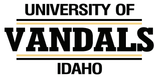
CL4 | Embroidery