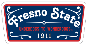
CL74 | Embroidered Patch