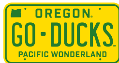
CL112 | Sublimated Patch