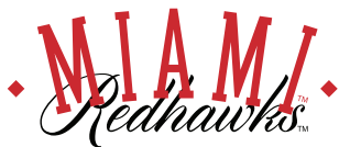
CL168 | Embroidery