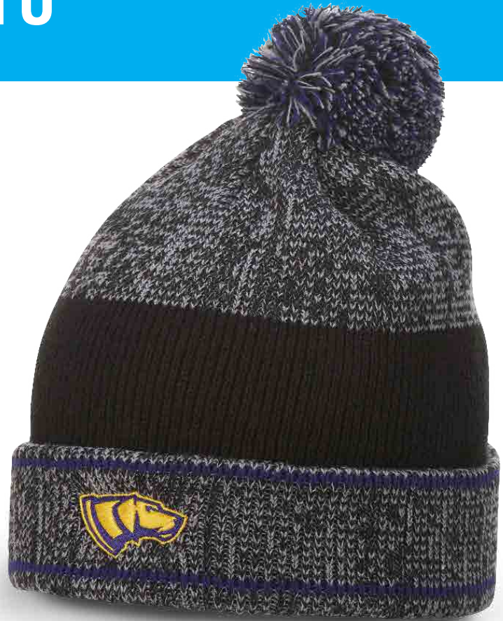
CL2 | Embroidery