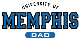
CL189 | Embroidery