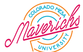
CL194 | Sublimation Transfer NEW