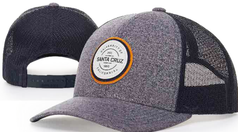
NEW CL182 | Screen Print Label Over Applique

FIT: ADJ. SNAPBACK | SIZE: SM, MD-LG | SHAPE: CASUAL STRUCTURED | FABRIC: COTTON-POLY JERSEY/POLY MESH | VISOR: PRECURVED | SWEATBAND: COTTON