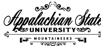
CL199 | Screen Print Transfer NEW