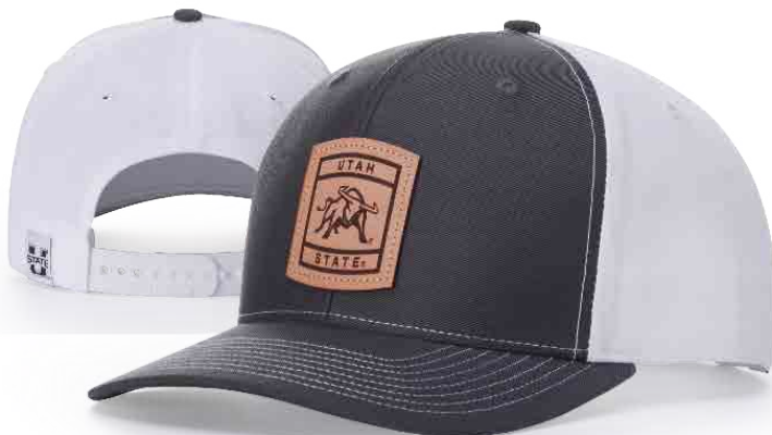
CL152 | Leather Applique

FIT: ADJ. SNAPBACK | SHAPE: MID-PRO | FABRIC: POLY-COTTON TWILL | VISOR: PRECURVED | SWEATBAND: COTTON