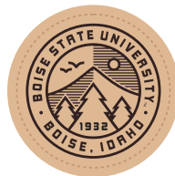
CL180 | Leather Applique NEW Featured on style 115, page 10