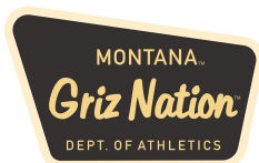
CL105 | Sublimated Patch