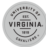
CL178 | Leather Applique NEW Featured on style 112, page 8