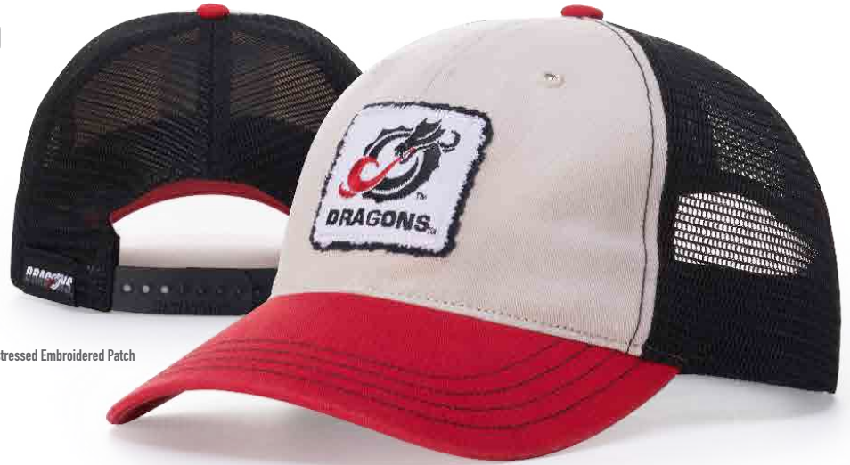
CL156 | Distressed Embroidered Patch

FIT: ADJUSTABLE SNAPBACK SHAPE: RELAXED UNSTRUCTURED FABRIC: TWILL/POLY MESH VISOR: PRECURVED SWEATBAND: COTTON