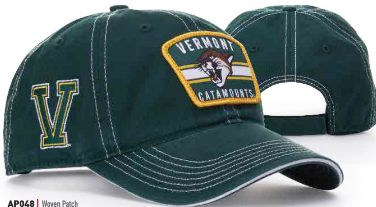
AP048 | Woven Patch

FIT: ADJ. HOOK-AND-LOOP | SHAPE: RELAXED UNSTRUCTURED | FABRIC: HEAVYWEIGHT CHINO TWILL | VISOR: PRECURVED | SWEATBAND: COTTON