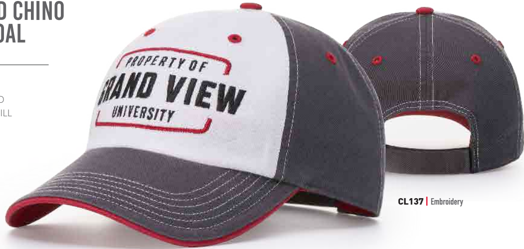
CL137 | Embroidery

FIT: ADJ. HOOK-AND-LOOP SHAPE: RELAXED UNSTRUCTURED FABRIC: HEAVYWEIGHT CHINO TWILL VISOR: PRECURVED SWEATBAND: COTTON