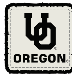
CL156 | Distressed Embroidered Patch Featured on style 111, page 11