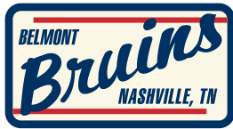
CL34 | Applique