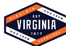
CL145 | Rubber Patch