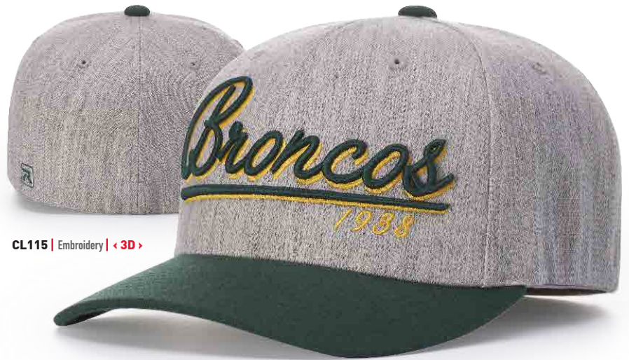
CL115 | Embroidery | < 3D >