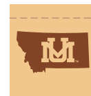
CL187 | Leather Clip Label NEW Featured on style 141, page 20