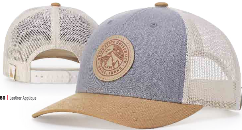
NEW CL180 | Leather Applique

FIT: ADJUSTABLE SNAPBACK SIZE: SM, MD-LG SHAPE: CASUAL STRUCTURED FABRIC: TWILL/POLY MESH VISOR: PRECURVED SWEATBAND: COTTON