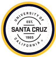
CL182 | Sublimated Label Over Applique NEW Featured on style 115CH, page 10