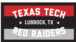
CL56 | Woven Label