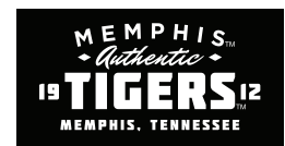
CL41 | Woven Label