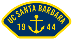
CL122 | Embroidered Patch