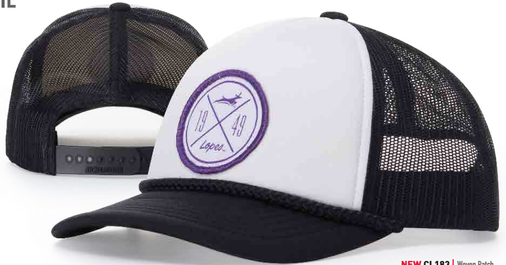
NEW CL183 | Woven Patch

ALTERNATE COLORS: First color is crown front panels. Second color is back mesh panels, visor, visor cord, backstrap, and button.