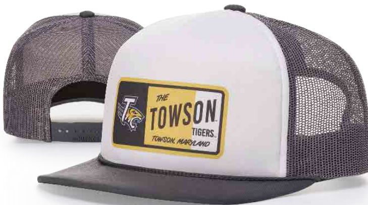
NEW CL184 | Sublimated Transfer

FIT: ADJ. SNAPBACK | SHAPE: STRUCTURED PINCH | FABRIC: FOAM/POLY MESH | VISOR: FLAT | SWEATBAND: COTTON