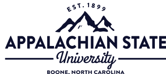
CL193 | Screen Print Transfer NEW