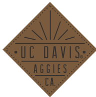
CL69 | Leather Applique