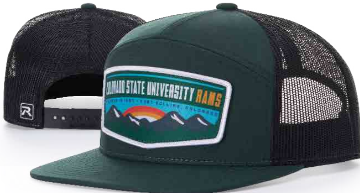
NEW CL173 | Sublimated Patch

FIT: ADJ. SNAPBACK | SHAPE: HI-PRO 7 PANEL | FABRIC: TWILL/POLY MESH | VISOR: FLAT | SWEATBAND: COTTON