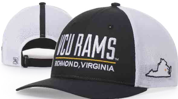
CL111 | Embroidery

FIT: ADJ. TECH HOOK-AND-LOOP | SIZE: SM-MD, LG-XL | SHAPE: CASUAL STRUCTURED | FABRIC: LTWT PERF/TECH MESH | VISOR: PRECURVED | SWEATBAND: STAY-DRI