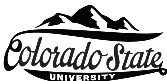
CL198 | Screen Print Transfer NEW