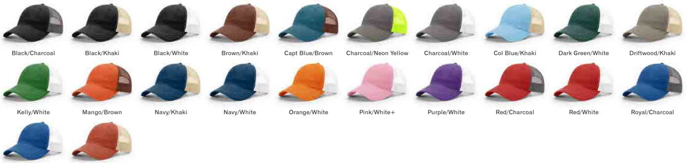
Black/Charcoal Black/Khaki Black/White Brown/Khaki Capt Blue/Brown Charcoal/Neon Yellow Charcoal/White Col Blue/Khaki Dark Green/White Driftwood/Khaki Kelly/White Mango/Brown Navy/Khaki Navy/White Orange/White Pink/White+ Purple/White Red/Charcoal Red/White Royal/Charcoal Royal/White Texas Orange/Khaki

SPLIT COLORS: First color is crown front panels, eyelets, visor, undervisor, and button. Second color is crown back mesh panels, backstrap, and contrast stitching on front panels and visor.