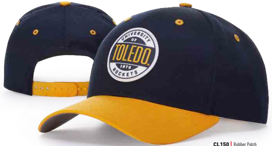
CL150 | Rubber Patch

FIT: ADJUSTABLE SNAPBACK SIZE: SM (6 1/2-7 1/8), MD-LG (7-7 3/4) SHAPE: MID-PRO FABRIC: POLY-COTTON BLEND VISOR: PRECURVED SWEATBAND: COTTON