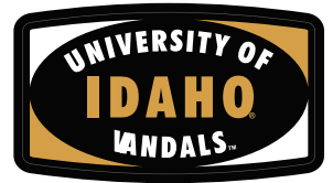
CL176 | Embroidered Patch NEW Featured on style 112FP, page 9