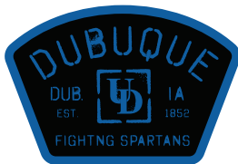
CL177 | Sublimated Patch NEW Featured on style 112P, page 9