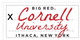
CL71 | Woven Label