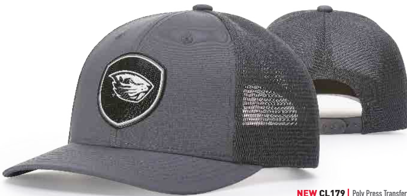
NEW CL179 | Poly Press Transfer

FIT: ADJ. SNAPBACK | SHAPE: CASUAL STRUCTURED | FABRIC: PTS LITE/SPORT MESH | VISOR: PRECURVED | SWEATBAND: STAY-DRI PERFORMANCE