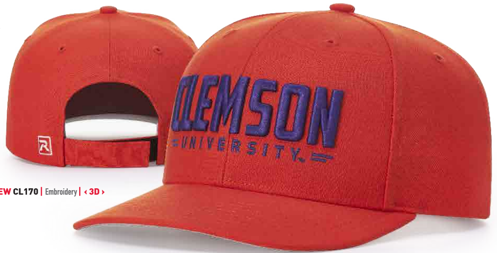
NEW CL170 | Embroidery | < 3D >

FIT: ADJUSTABLE HOOK-AND-LOOP SIZE: SM (6 1 / 2 -7 1 / 8 ), MD-LG (7-7 3 / 4 ) SHAPE: MID-PRO FABRIC: PERFORMANCE POLY-SERGE VISOR: PRECURVED SWEATBAND: COTTON