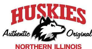
CL75 | Embroidery