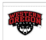
CL188 | Woven Clip Label NEW Featured on style 149, page 19